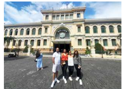
Centre Post Office