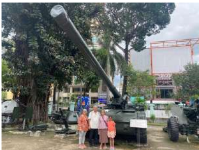
War Remnants Museum

Distance Tan Son Nhat Airport – Saigon Central: 7 – 8km -> 30 minute transfer