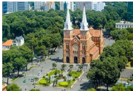
Cathedral of Notre Dame